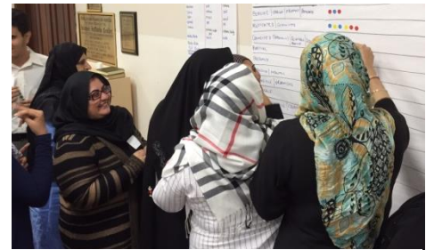
Involved in a democratic learning process

As the participants experienced various activities, they were asked, “How can I use this in Madrasah???” This generated additional ideas and brainstorming amongst the group to apply the learning into the classroom.