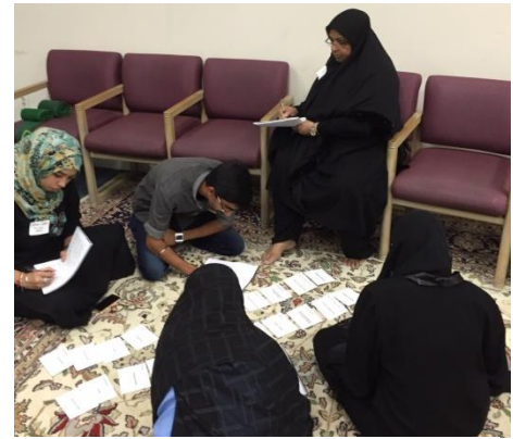
Learning through a card activity

“Excellent demonstration which really related to the topic well.”