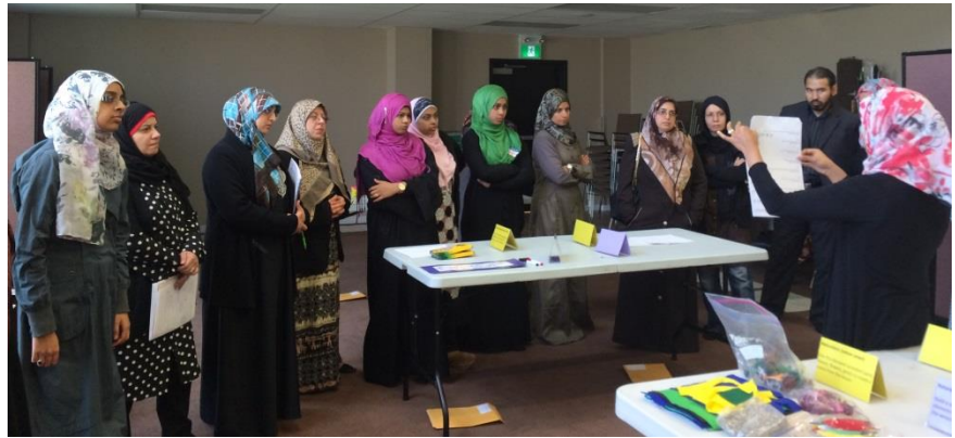
TST London participants experiencing the Multiple Intelligences activities

Participants are provided opportunity to create an action plan to highlight the strengths of the Madrasah and ways to develop further.