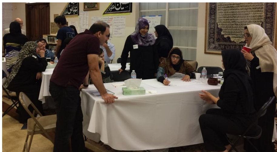
Brainstorming ideas for planning a lesson

The program emphasizes on the practical application of Islam to a Child’s life in a way that is positive and age appropriate.