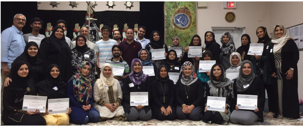
TST Miami participants

A special thank you goes to the program organizing team of London, Ontario and Miami, Florida.