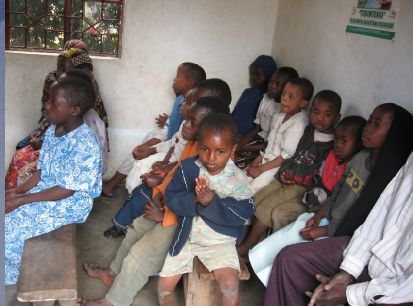
Children at KIBOWA Orphanage (Aug 2009)

I thank you LORD for giving me shelter (for not having to play on road sides) I thank you LORD for giving me a good home, one full of warmth, and healthy nourishment I thank you LORD for giving me good parents / guardian