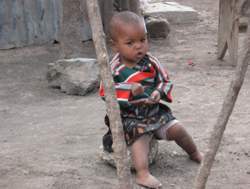
An Unga Ltd child (Sept 2009)