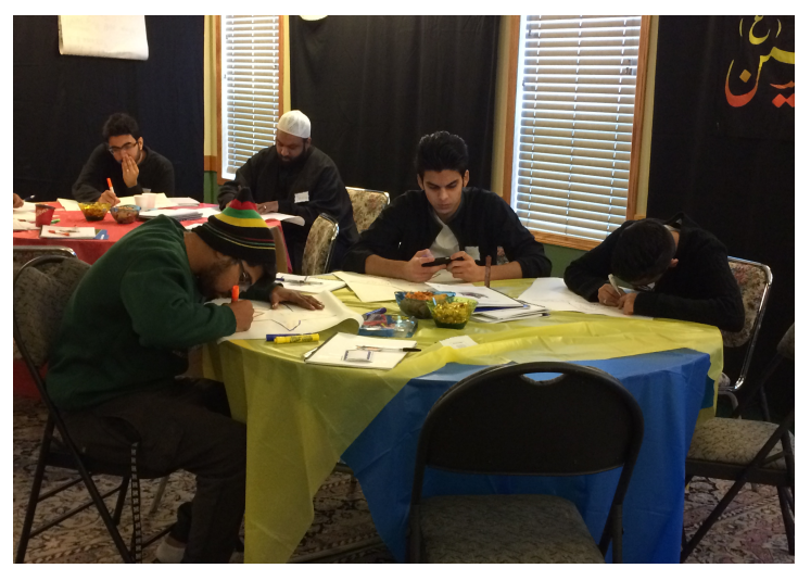
TST Edmonton Participants creating Professional Growth Plans

The session held in Allentown, PA was attended by teachers from New Jersey and Arizona. This was a powerful way for teachers from different madaris to network and exchange ideas.