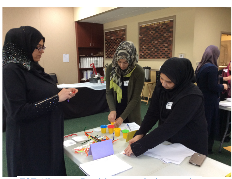
TST Allentown Participants exploring creative ways of teaching