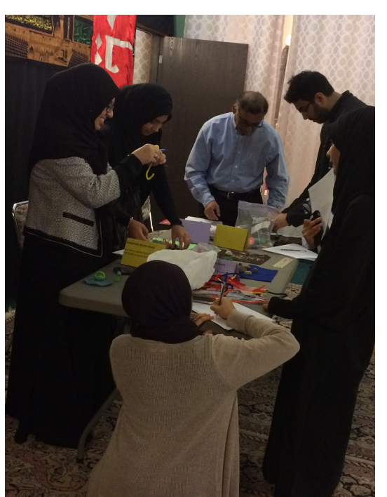
TST Edmonton Participants exploring creative ways of teaching

"Enjoyed overall workshop and it has helped me to become better at what I do!"