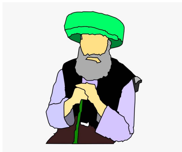
Ayatullah Sayid Mahdi Bahr al-Ulum